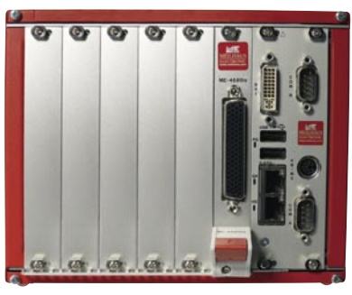
« Also available with 6 slots for 3 U CompactPCI boards: ME-Neuron XL (ME-2 XL)

As a complete, PC-based DAQ station with Windows you can use whatever software you want - VEE Pro, LabVIEW, C/C++ and others. If you want to use the ME-Neuron as a LAN DAQ station, only ME series boards supported by the ME-iDS can be used (ME-iDS is included with the ME boards), in combination with your favourite software development environment. The ME-iDS supports: Windows XP, 2000, Vista and GNU Linux 2.6. Visual C/C++, Visual Basic, VEE Pro (Windows), LabVIEW (Windows, Linux), Python.