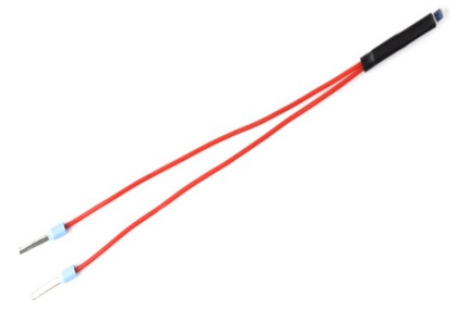
Test probe (Pt100 or Pt1000)