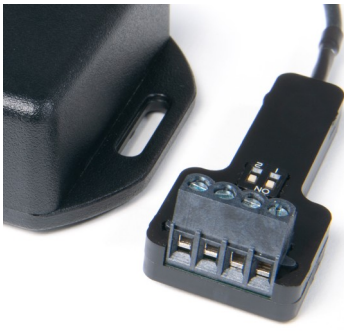
PT sensor terminal for 2-, 3- and 4-wire Pt100 and Pt1000 sensors