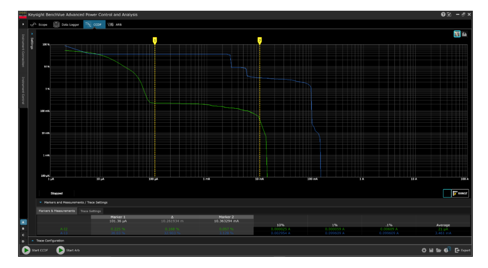
This CCDF measurement reveals the key attributes of current in a Bluetooth low energy devices