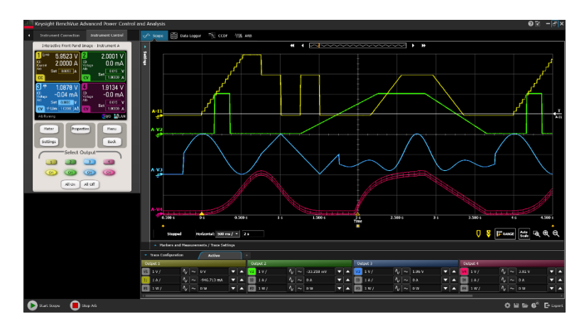
BV9200B connected to an N6705 with four DC power modules installed