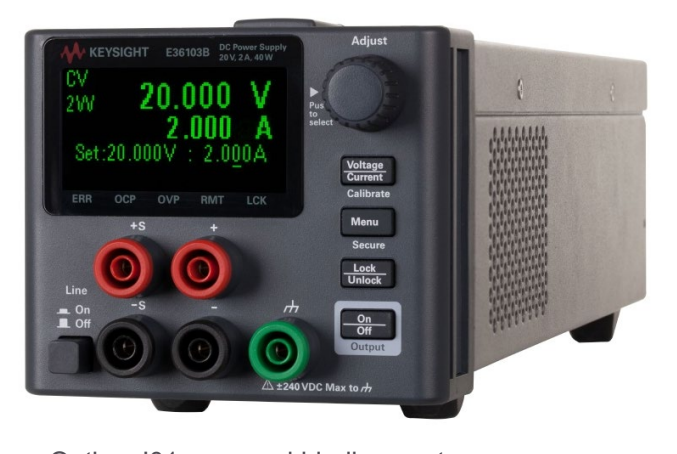
Option J01 recessed binding posts

Do you need to convert the power supply for different mains power? The two switches on the bottom of the instrument make it straightforward. See the product manual for details.