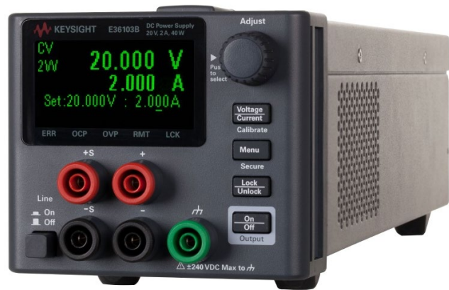
Option J01 recessed binding posts

Do you need to convert the power supply for different mains power? The two switches on the bottom of the instrument make it straightforward. See the product manual for details.