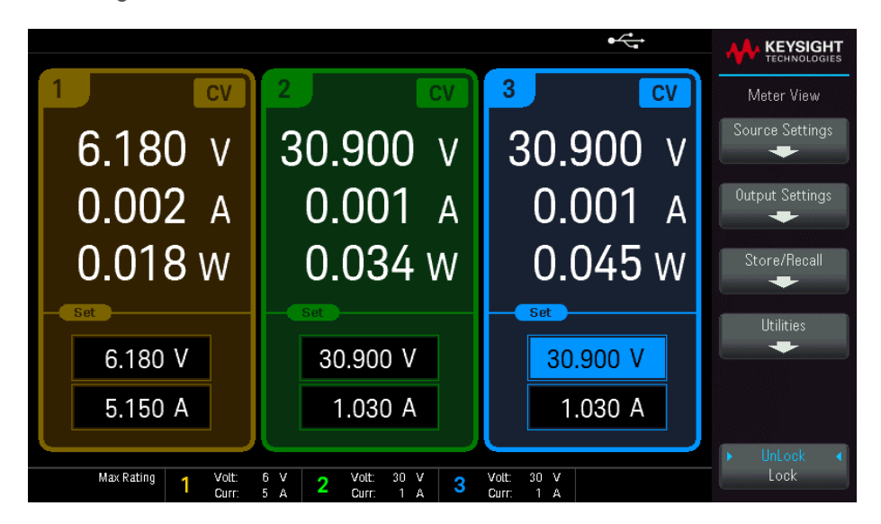
Figure 1. View of all three output simultaneously

Figure 1 shows the display with the voltage and current for all three channels with different views. Color-coded knobs along with display and binding posts help you prevent set up and connection errors so you can monitor the voltage and current value of all three channels simultaneously. Use the two knobs with rotary encoder control for voltage and current adjustments to make quick adjustments and configurations.