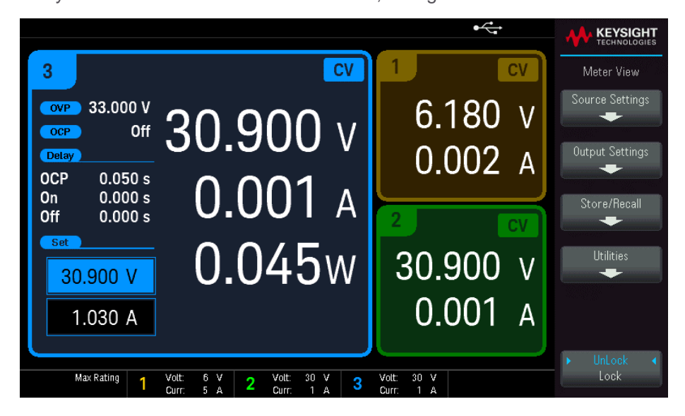
Figure 2. View details of a single channel including the measured power, OVP/OCP condition, and delays.

Figure 2 shows the single-channel view that includes the measured power, OVP / OCP condition, and delays. You can also monitor the readback, voltage and current for the other two channels.