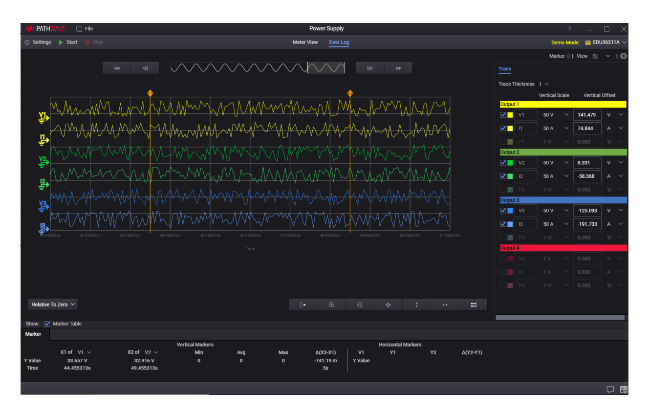
Figure 3. Data-logging with PathWave Benchvue software for the PC