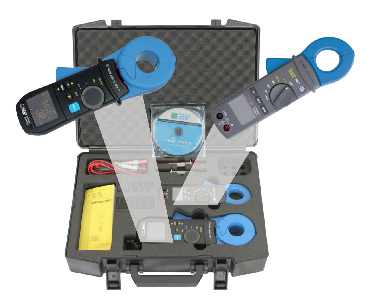
Measuring Clamp Set EmCheck®

To detect the quality of EMC compatible installation a measurement of the resistance in the potential equalisation by using the mesh resistance clamp EMCheck® MWMZ I and the identification of possible shielding currents through the leakage current clamp EMCheck® LSMZ I is recommended. With the set you have all tools on hand to verify the quality of your EMC conform installation.