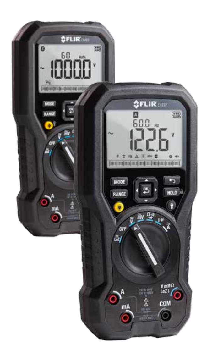
DM92 and DM93 feature powerful LED worklights