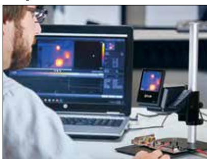
Connect over USB a computer to analyze data in FLIR Tools+