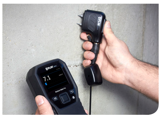
External pin probe for resistive moisture readings