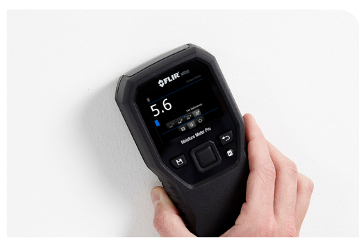
Verify moisture with pinless measurements