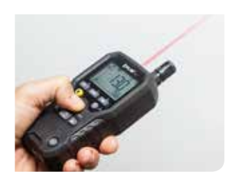
Integrated IR Thermometer with Laser Pointer to measure surface temperatures