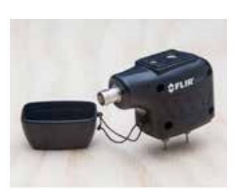
View measurements on your tablet with free FLIR Tools Mobile \,

MR02 .....Replacement Pin Moisture Probe