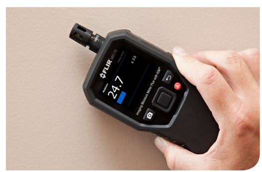
Verify moisture with Pinless measurements