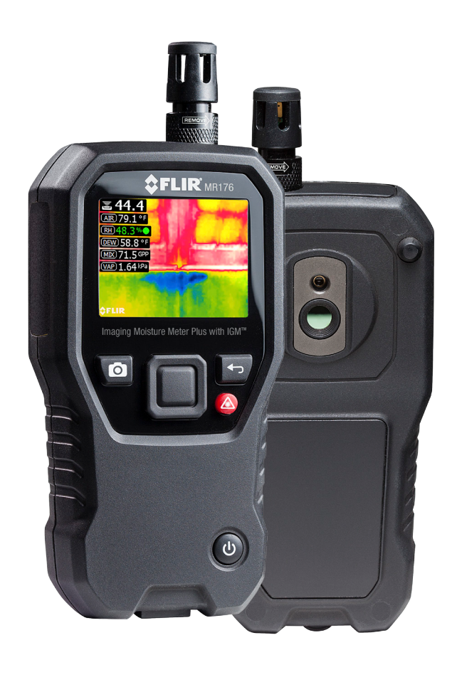
IGM technology guides you where to measure