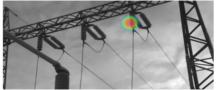
Example of Si124 PD severity assessment

The FLIR Si124-PD is an easy-to-use, stand-alone system for detecting partial discharge problems in high-voltage electrical systems. This lightweight, one-handed solution is designed to help engineering professionals identify issues up to 10 times faster than with traditional methods. With 124 microphones, the Si124-PD produces a precise acoustic image that visually displays ultrasonic information, even in loud environments and at long distances. The acoustic image is overlaid in real time on a digital camera picture, which allows the user to accurately pinpoint the source of the sound. Users can then apply the FLIR Severity Assessment analysis to classify the severity of the issue and provide guidance on recommended actions to resolve the problem. The Si124-PD features a plugin that enables users to import acoustic images to FLIR Thermal Studio suite for offline editing, analysis, and advanced acoustic and thermography report creation. Field analysis and reporting can also be done using the FLIR Acoustic Camera Viewer cloud service. Through a regular maintenance routine, the FLIR Si124-PD can help facilities save money on repairs and increase asset reliability.