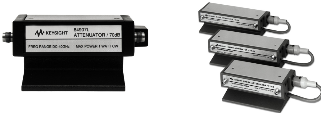
Figure 4. Programmable step attenuators.

Keysight programmable step attenuators offer fast, precise signal-level control up to 50 GHz, with switching time of less than 20 ms. Unmatched attenuation repeatability of less than 0.03 dB up to 5 million cycles per section ensures low measurement uncertainty and reduces calibration cycles when installed into test systems. Automatic GPIB/USB/LAN drive control is achieved with the 11713B/C attenuator/switch driver.