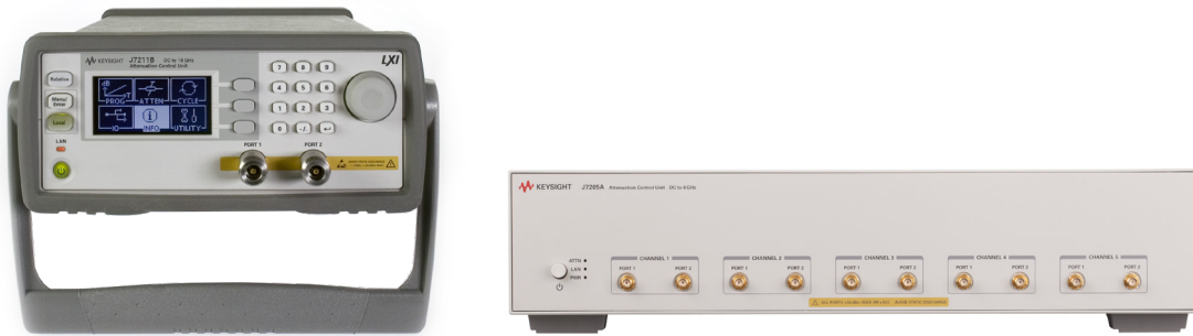
Figure 5. Attenuator control unit.