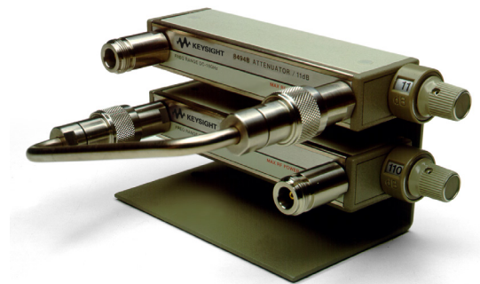
Figure 6. Two attenuators (not included) connected with an interconnect kit.