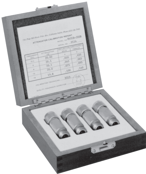
Figure 7. Coaxial fixed attenuator set.

Sets of four coaxial fixed attenuators with attenuations of 3, 6, 10 and 20 dB are provided in a walnut accessory case. These sets are ideal for calibration labs or where precise knowledge of attenuation and SWR is desired.