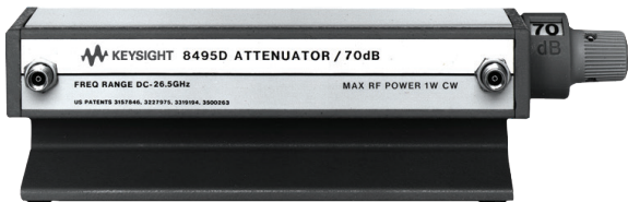
Figure 3. Manual step attenuators.

Keysight manual step attenuators offer fast, precise signal-level control up to 26.5 GHz. Unmatched attenuation repeatability of less than 0.03 dB up to 5 million cycles per section ensures low measurement uncertainty. Attenuation range of 121 dB in 1 dB step can be achieved by cascading 2 attenuators in series.