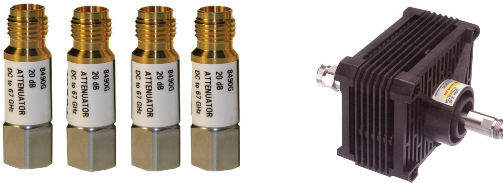
Figure 2. Coaxial fixed attenuators.

Keysight coaxial fixed attenuators provide precise attenuation, flat frequency response and low SWR over broad frequency range. These attenuators are available in nominal attenuations of 3, 6, 10, 20, 30, 40, 50 and 60 dB to cater to various applications and setups.