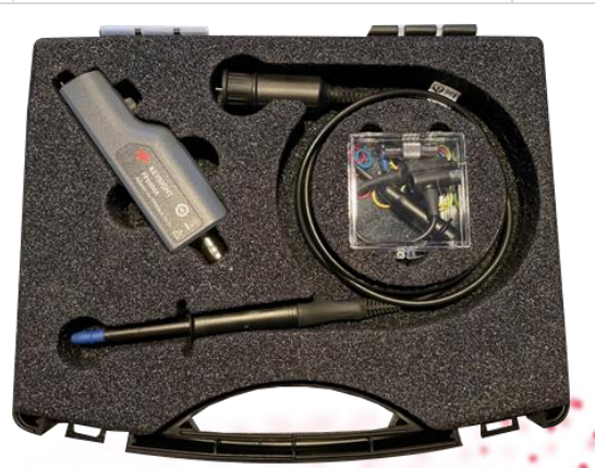
Figure 2. PP0004A ships in a convenient padded storage case, with space for an accompanying probe and accessories. Pictured here is the PP0004A in its case with a PP0001A.