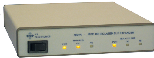
4860A Isolated Bus Expander

The 4860A Isolated Bus Expander allows a user to connect up to 27 GPIB devices to a single controller and overcome the specification limit of 14 devices and 20 meters of bus cables in an IEEE 488 Bus system. To increase the number of units in a system beyond 14 devices, one of the existing devices is replaced with a Model 4860A which then drives up to 14 additional devices as shown in the figure below. The 4860A Isolated Bus Expander also drives an additional 20 meters of cable which extends the maximum cable length to 40 meters. Multiple Bus Expanders can be used in parallel to add even more devices to the system or extend the cable length.