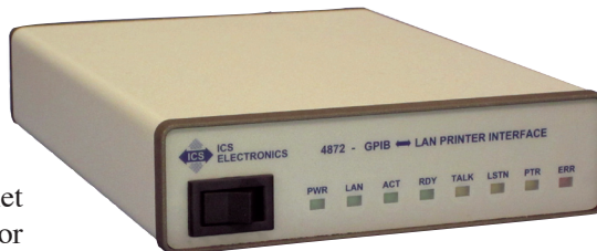
4872 GPIB-to-LAN Printer Interface

To reproduce graphical data and plots from the instrument, the selected printer must have PCL5 or later firmware with HPGL/2 capability to print the instrument's HPGL/2 graphic output. Fortunately there are many low-cost printers available that meet this requirement. Refer to ICS's Application Bulletin AB48-45 for a partial list of PCL/HPGL compatible and recommended printers. Use the 4872's built-in test page to verify an existing printer's HPGL capability.