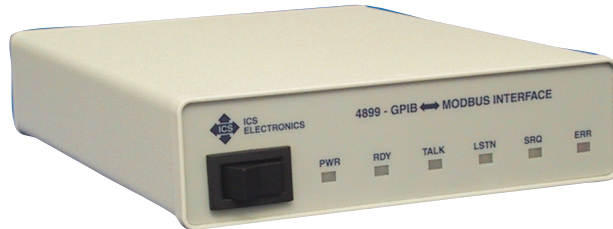
4899A Modbus Interface

The user sends simple commands to the 4899A that sets the Modbus device address, specifies the Modbus device register to be read or written to and the data value. The 4899A converts these commands into the Modbus RTU format, adds the CRC checksum and transmits the messages to the Modbus device. Received messages are checked and the responses to queries are outputted to the GPIB bus when the 4899A is next addressed to talk.