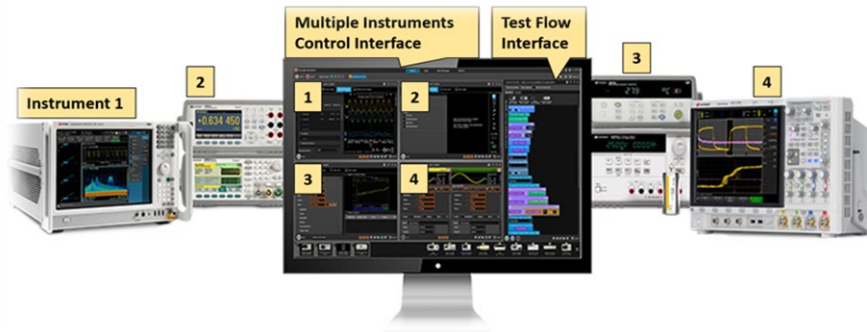
Figure 2. Multiple instruments integrated control with BenchVue Control Collection Apps.

BenchVue Control Collections apps provide lecturer and students with integrated instrument control, auto data logging, data remote access and easy report sharing, all on one PC. The 20+ instrument control apps support over 500 Keysight instrument models of various types including DMM, oscilloscope, power supply, function generator, signal generator, network analyzer, signal analyzer, source measure unit, data acquisition and more.