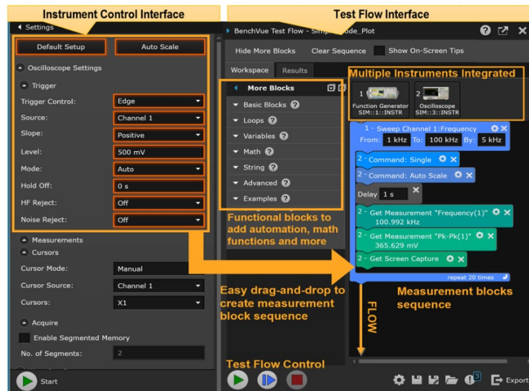
Figure 3. Test Flow Feature Graphical User Interface

Test flow feature enables automated test sequences from multiple instruments. It has an easy to use drag-and-drop graphical user interface to create measurement blocks without the need of programming. There are functional blocks to add various instructions, math functions, advanced tools and more, for a truly automated measurement system. Results tab to preview test flow sequence or to automatically logs and store actual measurement data. Test flow sequences can be saved in a file for reuse or easy sharing in the lab.