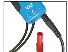
Removable test leads