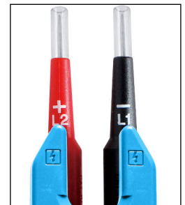
IP2X probes (2mm and 4mm)