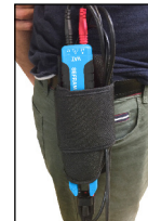
SC523 belt cover