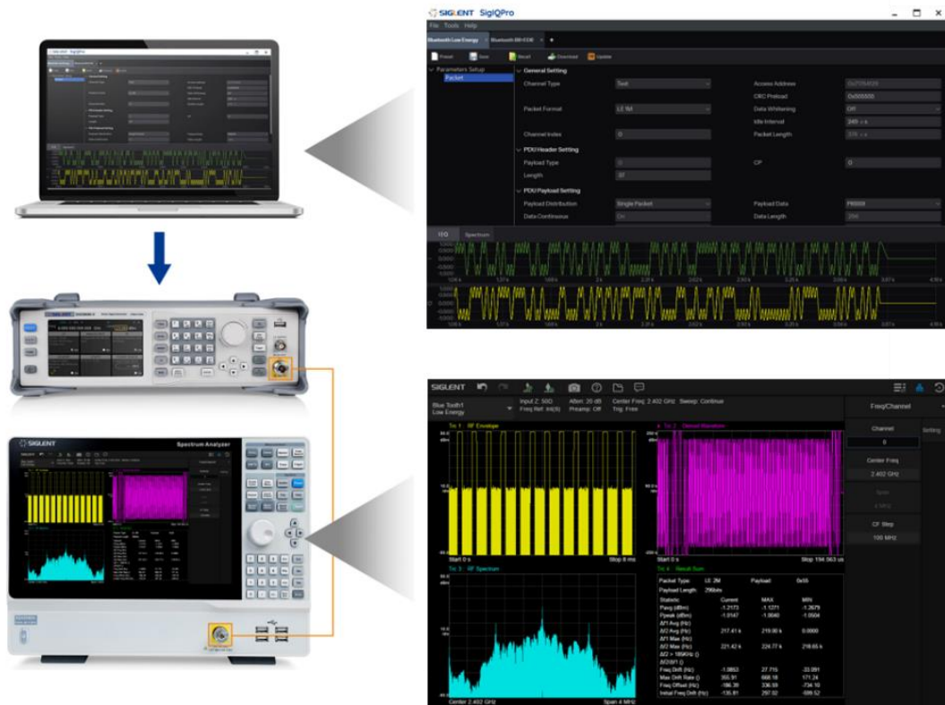
Figure 1-1 Connection settings