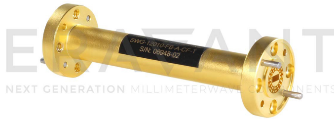
STQ Contactless Flange Front View