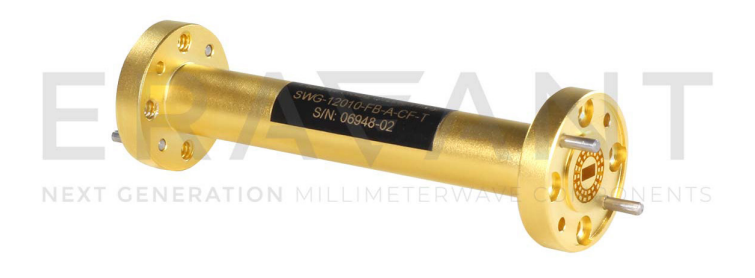
STQ Contactless Flange Front View