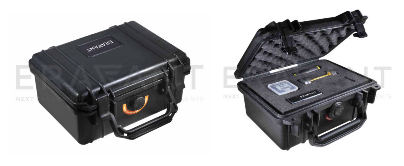
STQ Case Outside View