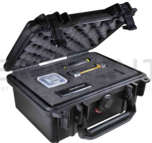
STQ Case Inside View