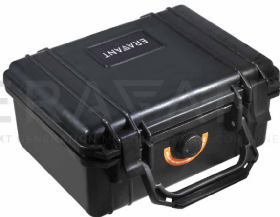
STQ Case Outside View