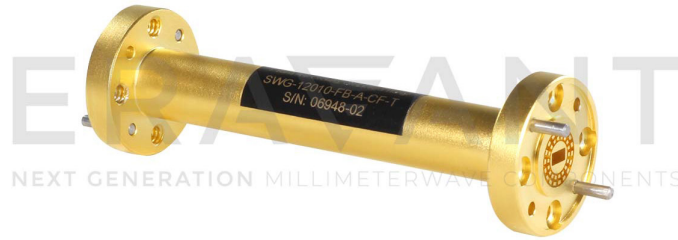
STQ Contactless Flange Front View