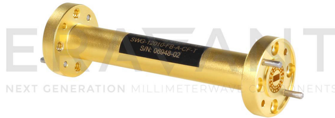
STQ Contactless Flange Front View