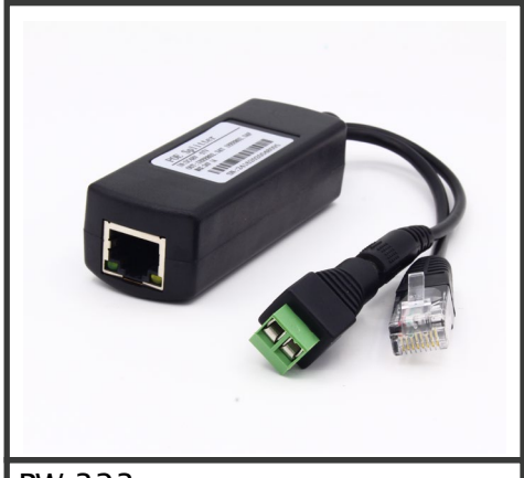
PW-323 PoE Splitter

Made In Manufactured in GB by Brainboxes