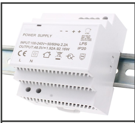
PW-301 DIN Rail Power Supply