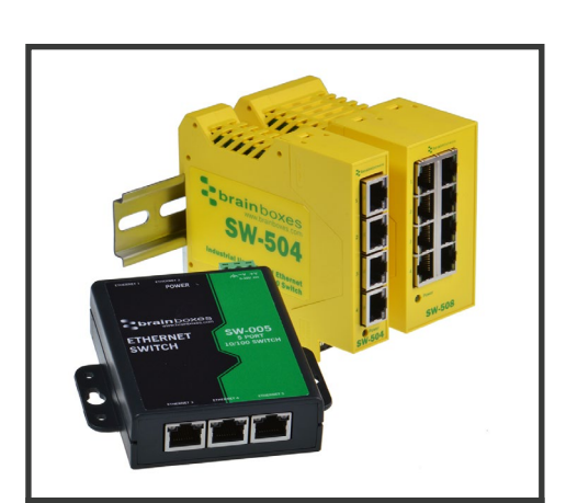
SW Range Switch products available in a range of formats and specifications.