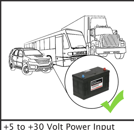
+5 to +30 Volt Power Input enables the device to be run from a standard car battery ideal for in vehicle applications