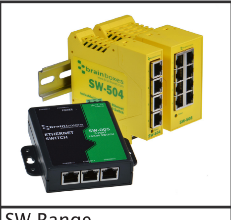
SW Range Switch products available in a range of formats and specifications.