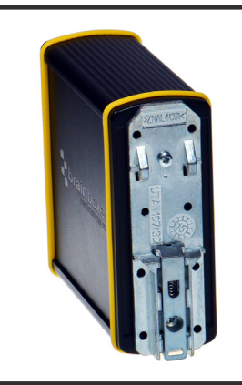
Integral DIN mount and slim design provides Ethernet connection to multiple devices