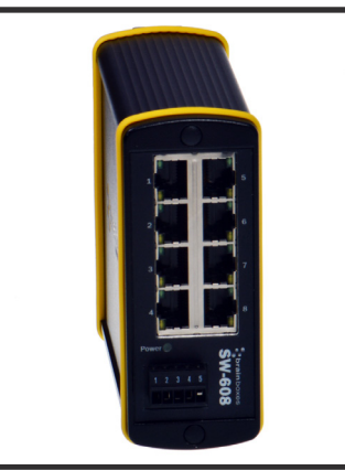
Tough IP50 aluminium casing with removable numbered power terminal for easy wiring