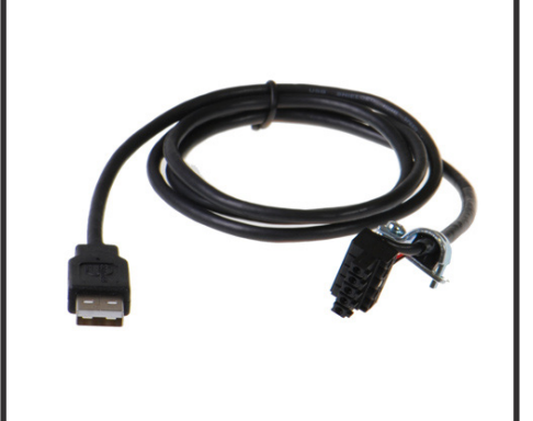
PW-650 Power supply with USB connector and prewired screw terminal block. Suitable for use with 5V USB ports.

PW-600 Power supply with connectors for UK, USA, EU and AUS mains socket. 'Tails' are suitable for connecting to screw terminal blocks.