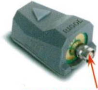
To TekProbe-BNC Interface

T2R1000 converts the TekProbe-BNC interface to RIGOL-Probe interface and supplies power, calibration and DC offset adjustment function for probe.