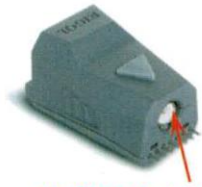
To RIGOL-Probe Interface