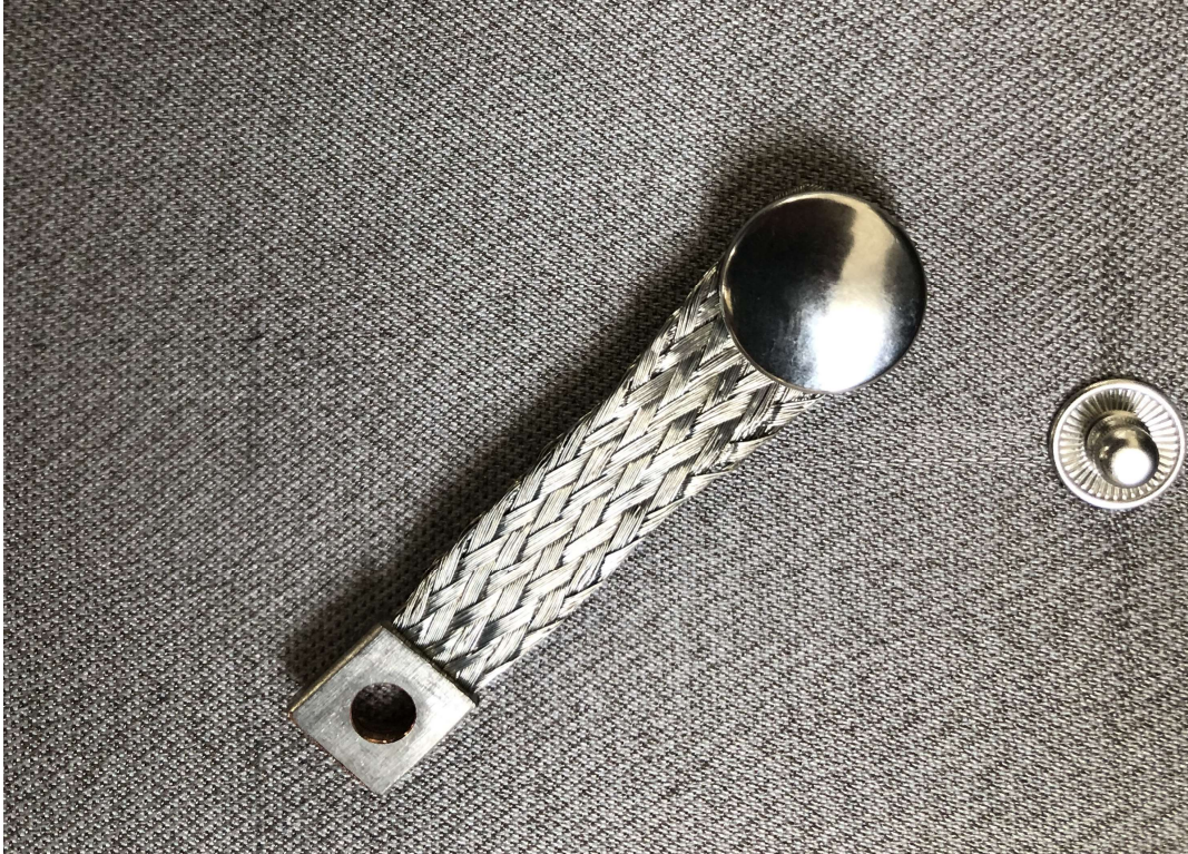
Picture 3: using textile rivets to establish electrical contact to the ground plane

The photo below shows an example, using rivets from a low cost textile riveting set along with a woven ground strap. The ground strap is clamped in between the two halves of the female rivet.