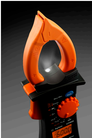
Figure 2. Built-in LED flashlight to illuminate test area