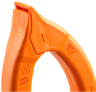
Figure 1. The unique wire separator allows you to separate and measure individual wires more easily

The U1190 Series clamp meters are built to perform in the environments you work. The unique wire separator allows you to effortlessly isolate and perform measurements on individual wires in a bundle. For improved visibility when making measurements, these clamp meters also come with an easily activated built-in LED flashlight that illuminates the test area. These features ensure that you are better equipped when making measurements.