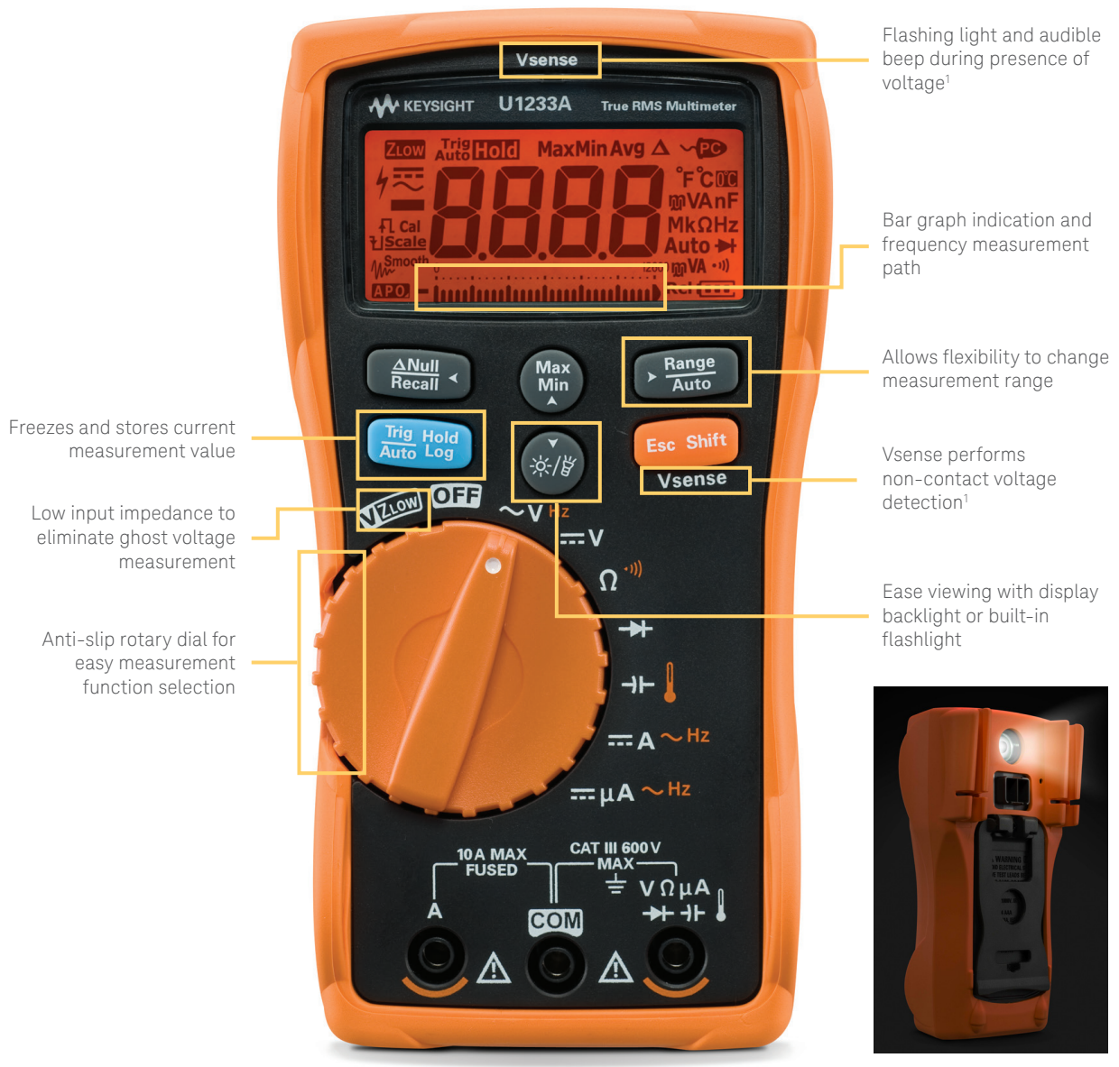
Figure 1. U1230 Series front view