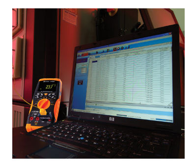
Figure 1. Automate recording of measurements with bundled GUI data-logging software.