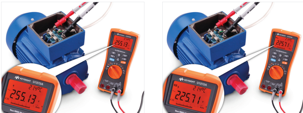
Figure 1. Comparison of voltage output from industrial motor VFD without and with Low Pass Filter functionality.

The U1270 Series offers a 1 kHz LPF or Low Pass Filter to provide accurate Variable Frequency Drive (VFD) output measurements. This function eliminates high frequency noise and harmonics, ensuring motor filter efficiency.