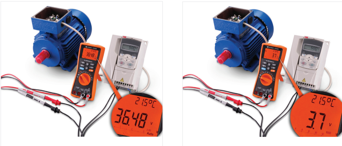
Figure 2. U1272A helps you identify the presence of stray voltage on a disconnected wire running parallel with the wire powering up the VFD to an industrial motor. The image on the right shows the U1272A in low impedance mode.

The peak detect function allows you to capture the engine or motor startup transient as fast as 250 \mu s.