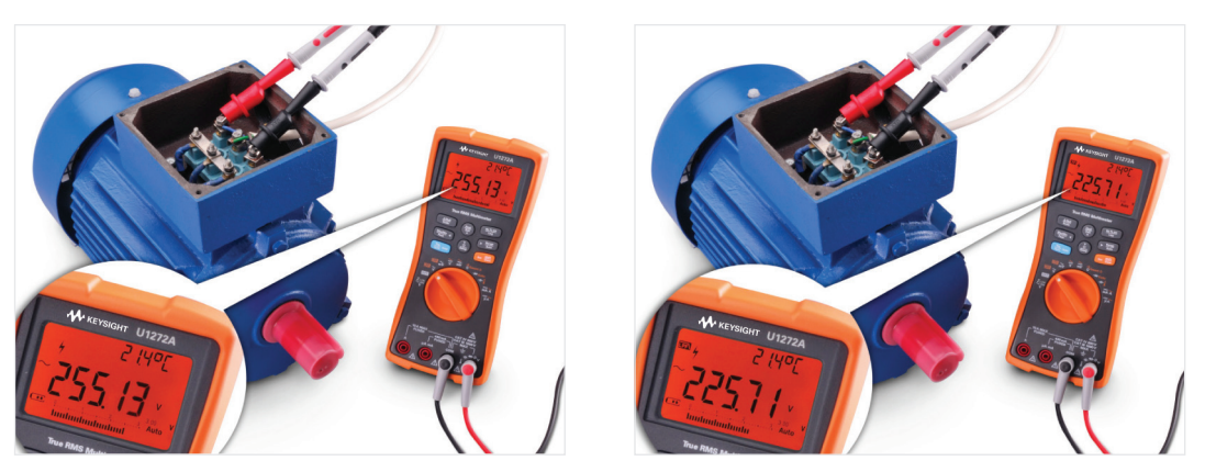
Figure 1. Comparison of voltage output from industrial motor VFD without and with Low Pass Filter functionality.

The U1270 Series offers a 1 kHz LPF or Low Pass Filter to provide accurate Variable Frequency Drive (VFD) output measurements. This function eliminates high frequency noise and harmonics, ensuring motor filter efficiency.