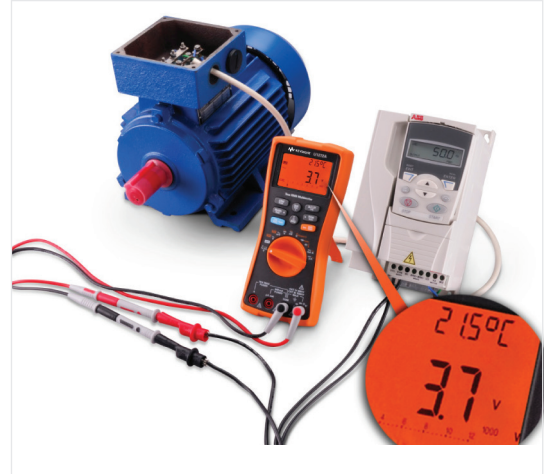
Figure 2. U1272A helps you identify the presence of stray voltage on a disconnected wire running parallel with the wire powering up the VFD to an industrial motor. The image on the right shows the U1272A in low impedance mode.