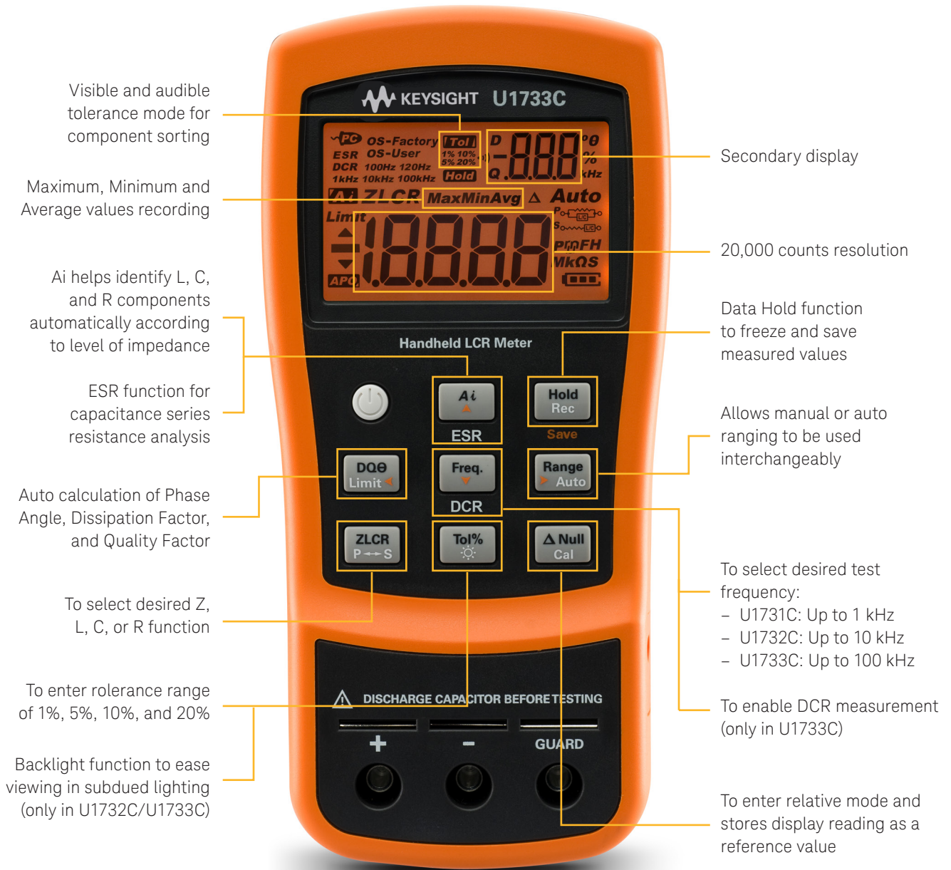
Figure 2. Front view of the U1733C