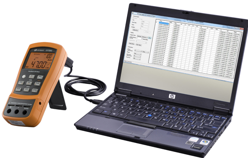
Figure 1. Automate the recording of continuous readings when you hook the U1731C/U1732C/U1733C to a PC

The handheld LCR meters allows you to test various component types, including secondary components of Dissipation Factor (D), Quality Factor (Q), and Angle Indication of Impedance ( \theta ). This new handheld series also includes other functions that result in a more detailed component analysis. For example, the built-in Equivalent Series Resistance (ESR) function helps you better understand the inherent resistance behavior typically found in capacitors across selected frequencies. DCR is a built-in DC resistance measurement that eliminates the use of a separate digital multimeter (DMM) for component test.