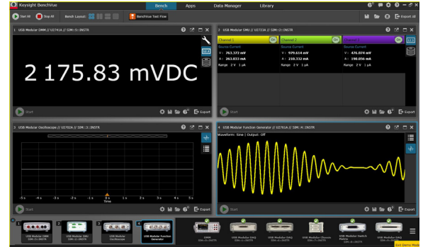
View measurements across USB DAQ, modular and bench instruments all on one BenchVue interface

The USB Modular Oscilloscope App within BenchVue allows you to quickly configure and control the U2701A/2A Oscilloscope to capture and annotate screen images, record trace data and log measurements. This capability provides you with the insight you need to solve your measurement challenges and detect glitches or bugs in signals. In just a few clicks, you can also record measurements and export results to popular PC-friendly applications such as Microsoft Excel and Microsoft Word for further analysis. Additionally, you can also export data to HDF5.