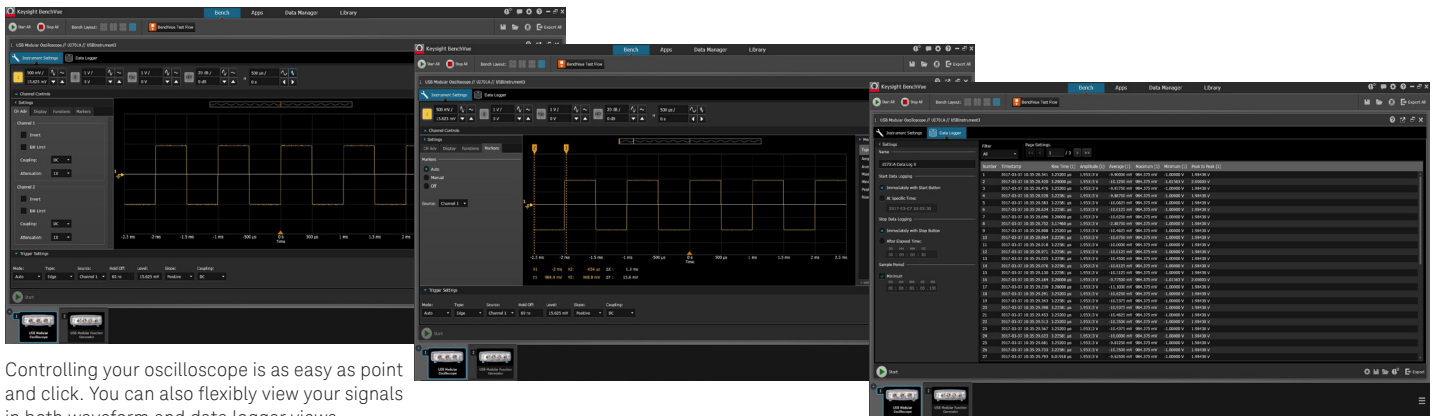
Controlling your oscilloscope is as easy as point and click. You can also flexibly view your signals in both waveform and data logger views.

Get started with BenchVue, downloadable at no cost at www.keysight.com/find/benchvue .