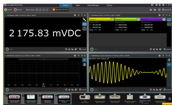
View measurements across USB DAQ, modular and bench instruments all on one BenchVue interface

The USB Modular Oscilloscope App within BenchVue allows you to quickly configure and control the U2701A/2A Oscilloscope to capture and annotate screen images, record trace data and log measurements. This capability provides you with the insight you need to solve your measurement challenges and detect glitches or bugs in signals. In just a few clicks, you can also record measurements and export results to popular PC-friendly applications such as Microsoft Excel and Microsoft Word for further analysis. Additionally, you can also export data to HDF5.