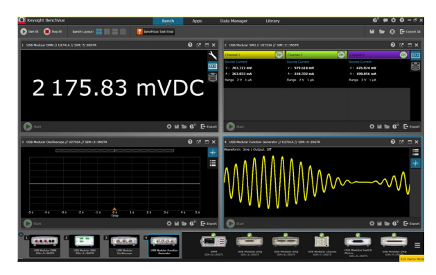
View measurements across USB DAQ, modular and bench instruments all on one BenchVue interface.

The USB Modular SMU App within BenchVue allows you to quickly control the U2722A/U2723A SMU to visualize measurements, perform data logging and annotate captured data. With BenchVue, you can visualize multiple SMU channels simultaneously, in addition to performing the following: