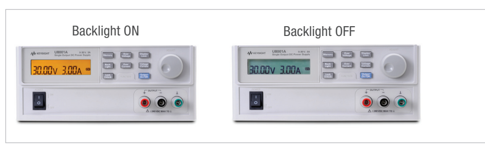
Figure 2. Backlight on/off options for LCD display