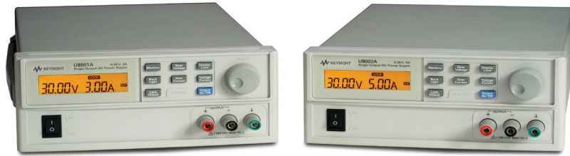
Figure 1. The U8001A 90 W and U8002A 150 W single output DC power supplies