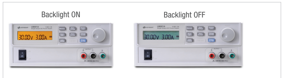
Figure 2. Backlight on/off options for LCD display