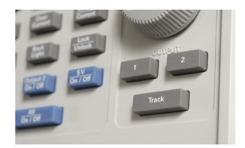
Figure 3. Simplifies Output 1 and Output 2 setup with tracking feature