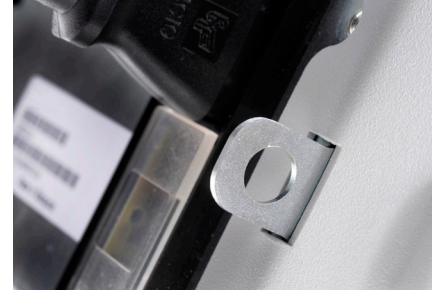
Physical lock mechanism as illustrated

Essential security features: Over-voltage protection (OVP)/ Over-current protection (OCP), keypad lock and physical lock mechanism