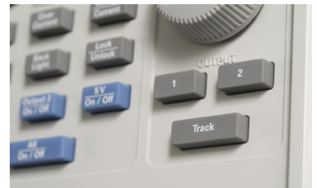
Figure 3. Simplifies Output 1 and Output 2 setup with tracking feature