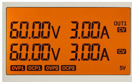
Figure 2. Backlight on/off feature with dual reading (voltage and current) on an LCD display