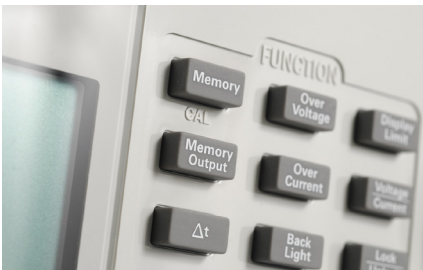
Figure 1. Output sequencing made easy with intuitive keypads

Both models of the U8030 series come with a set of features to suit your needs while remaining easy to use. The LCD screen displays both voltage and current readings in a one-view panel while the all ON/OFF button allows multiple outputs to be controlled simultaneously. Additionally, the auto-track feature simplifies setup between output 1 and output 2. With these, you get a solid bench power supply plus a set of convenient and easy to use features.