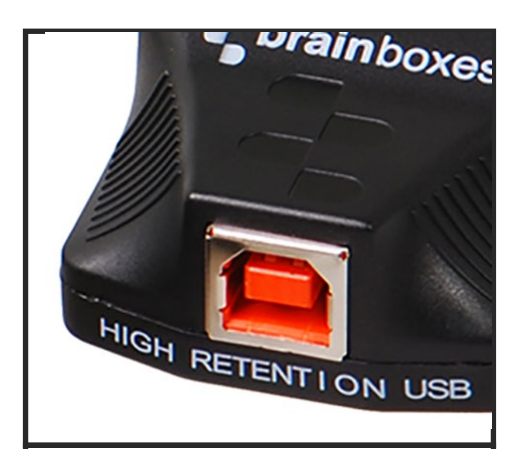
High retention USB connection requires a minimum withdrawal requirement of 15N (thats a force of 1.5Kg or 3.4lbs)