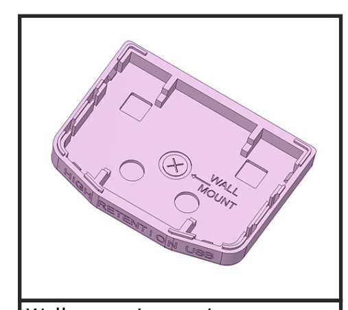
Wall mounting option