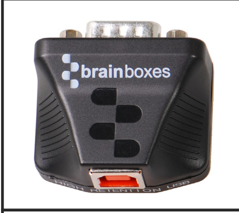
IP-50 rated non-conducting case