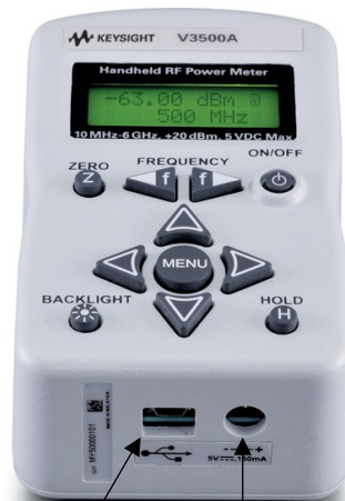
Figure 1. Signal connection

USB type Mini-B port for connection to PC